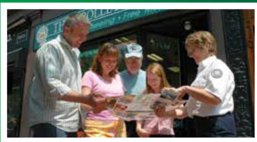
100% Money Back Guarantee