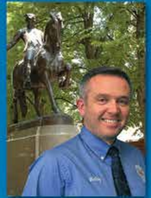
Paul Revere House

Old Town Trolley Tours® is Boston’s largest and most trusted sightseeing tour company, entertaining guests for 30 years. Our commitment to outstanding guest service is backed up by our 100% money-back guarantee! We’re the biggest because we’re the best!