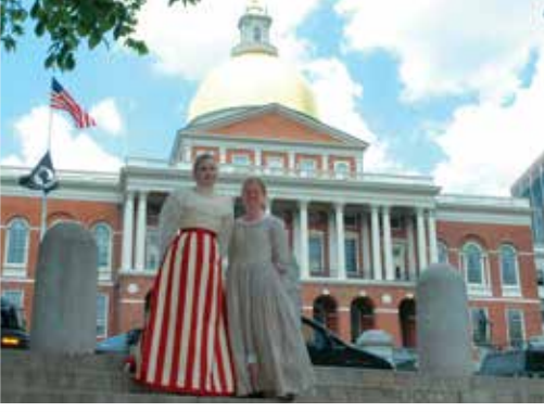
New State House