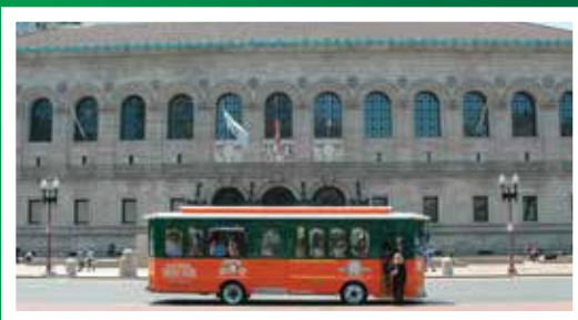
Boston's Most Frequent Trolleys - Less Waiting Time.