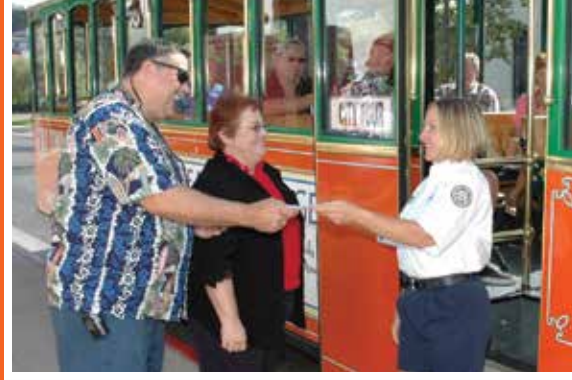
The Attraction that Takes You to the Attractions