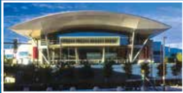
Boston Convention Center