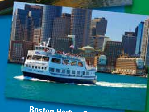
Boston Harbor Cruise