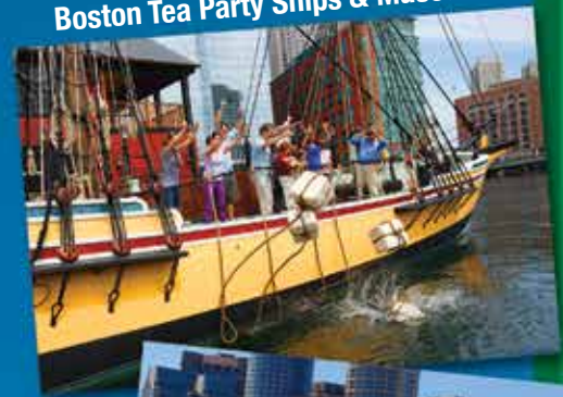
Boston Tea Party Ships & Museum

Boston Harbor Cruise: Enjoy a 45-minute sightseeing cruise with panoramic views of the Boston skyline.