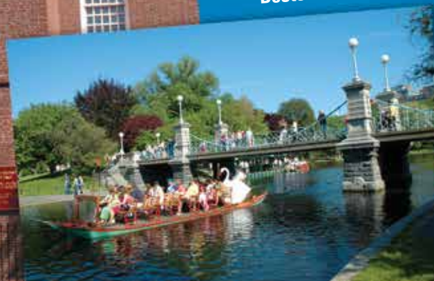
Boston Public Garden